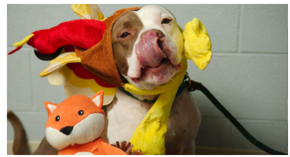
Pongo, Cabin and Faith are still looking for forever homes! They will be featured soon on Social Media in hopes of finding their perfect matches.